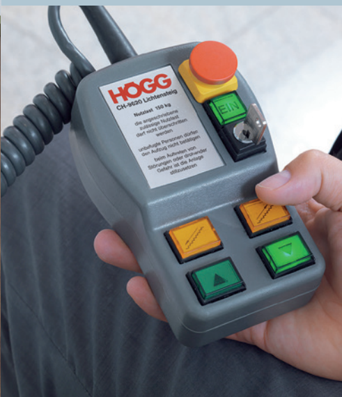
Manual control unit on spiral cable for individual operation