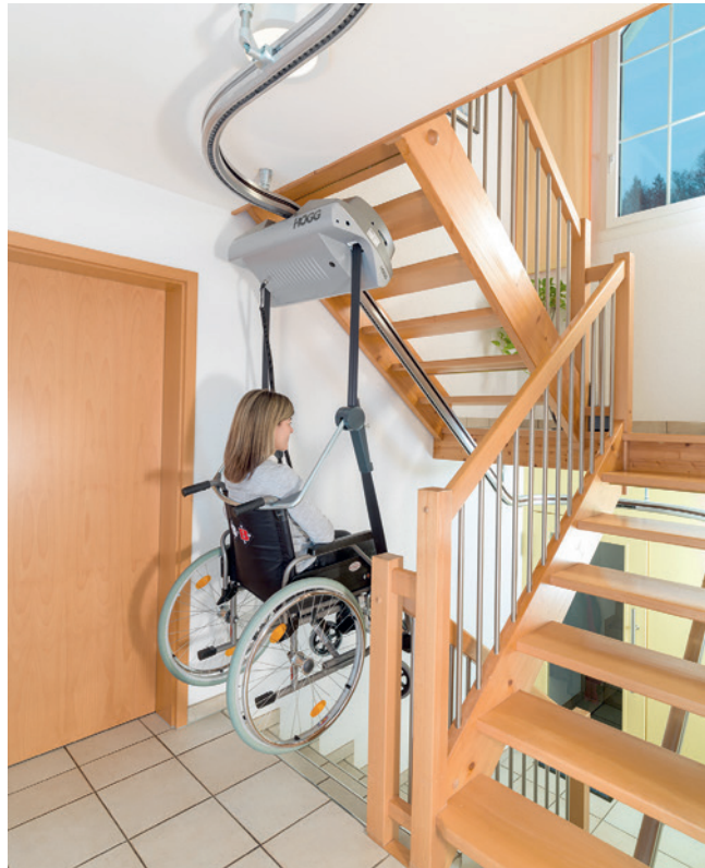
Rail led elegantly under the stairs