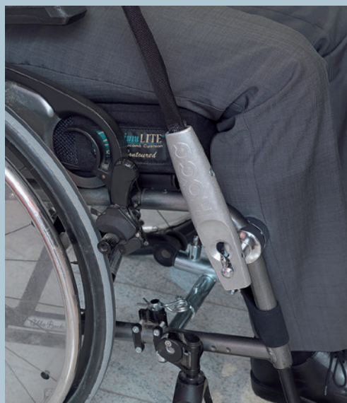
Front attachment to the wheelchair