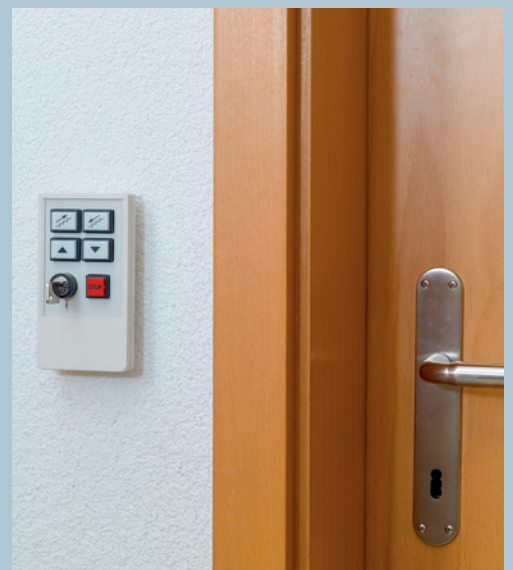
Wireless station for calling and sending the lift